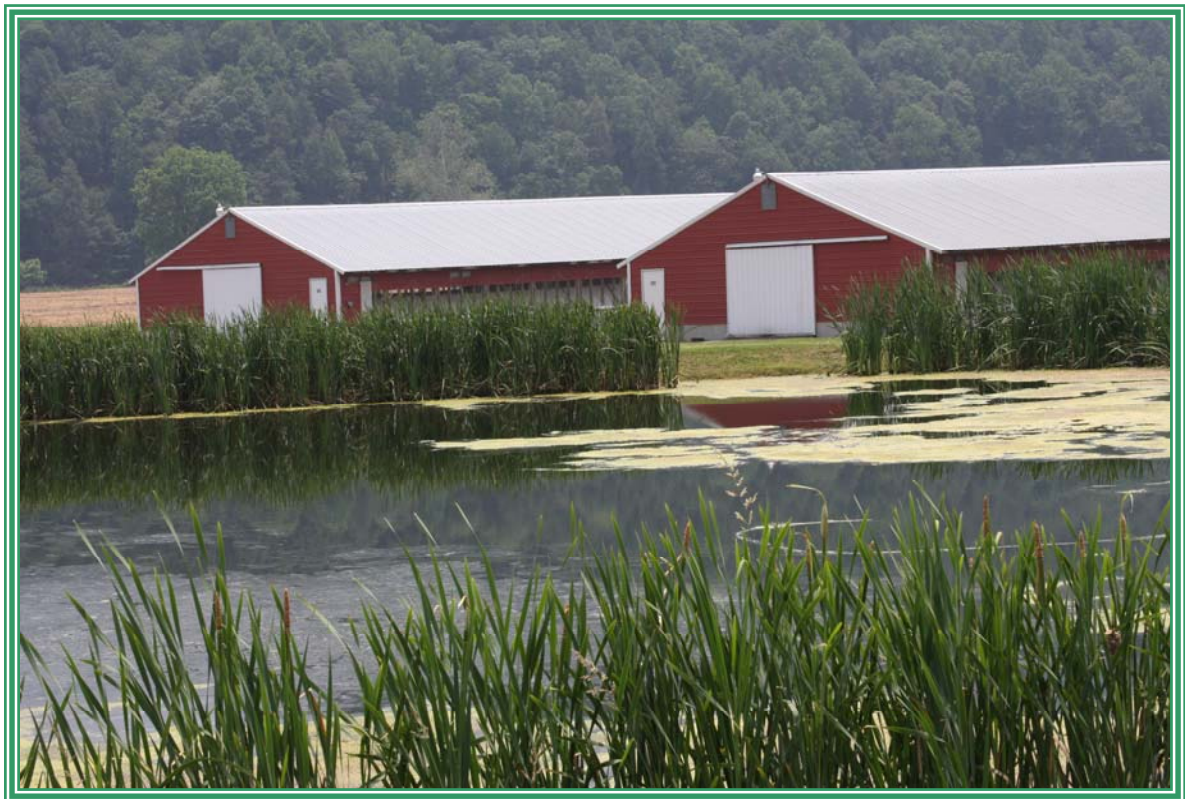
Wilkins Poultry Farm, Lost River, WV